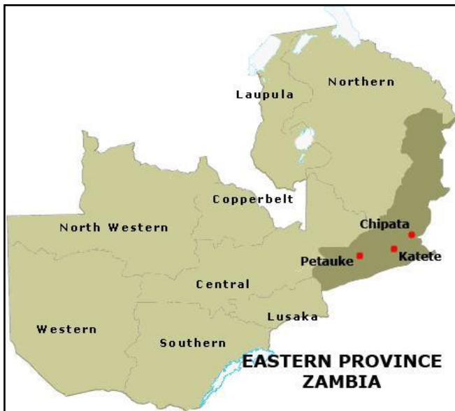
Figure 2. Three Districts in Eastern Province, Zambia that were the focus of the bicycle ambulance project

partners. Key to the implementation was the role of World Bicycle Relief, the lead partner. d