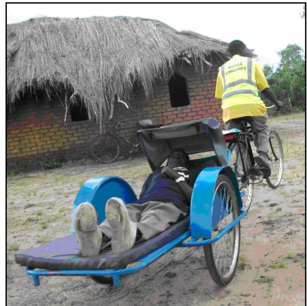
Figure 1. A patient being transported by bicycle ambulance in Chipata District, Zambia

The delays in access to health services caused by the difficulties in raising money are one of the important contributors to the occurrence of obstetric fistula and the increased vulnerability among Ethiopian women to it. iv