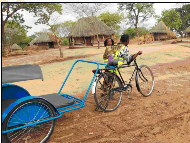
Figure 4. The "Namibian" style of bicycle ambulance constructed during the Zambia project.

The full canopy of the ambulance provides privacy - especially important for expectant mothers. The canopy also shelters the clients from the heat of the sun and the rain. The ambulance is readily available when needed, unlike the cart whose oxen have to be fetched from the fields, often far from the villages. The convenience of a stretcher has also made it much easier to cross rivers or to take routes on foot that a bicycle or ox-cart could not take.